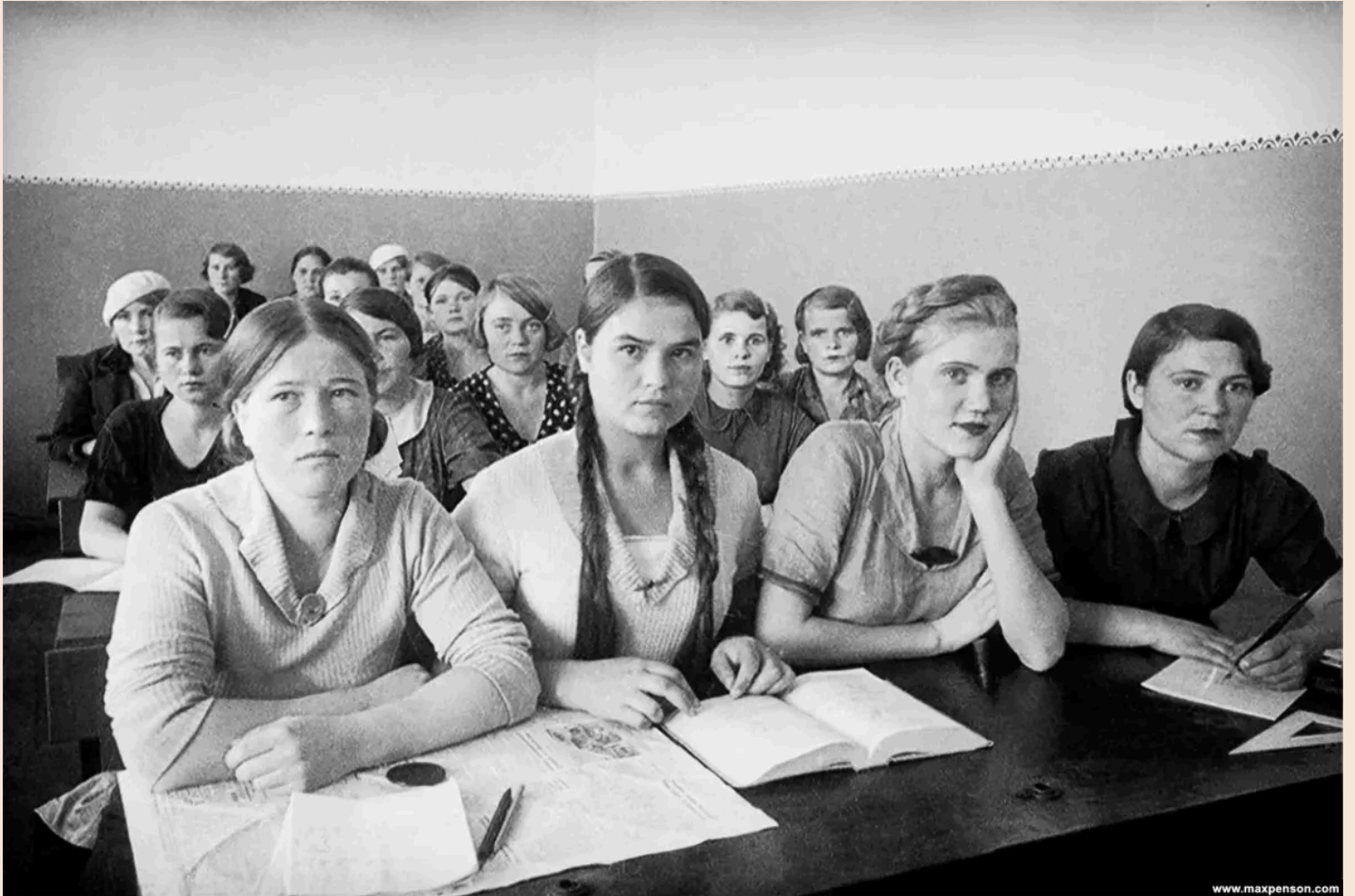
Young women seated in a classroom in Tashkent, located at the time within the Uzbek SSR, c. 1930s-1940s.

Photograph by Max Penson, accessed via Radio Free Europe/Radio Liberty. Exact rights status unknown, but likely available in the public domain.